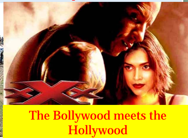
The Bollywood meets the Hollywood