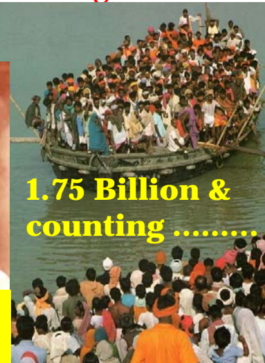
1.75 Billion & counting .....