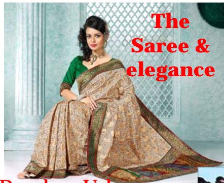
The Saree & elegance

Special focus: Diversity of human, social, cultural & economic spaces within/among the countries of South Asia. Readings & discussions on: Historical evolution & its unique identity; British imperialism/impacts; Economic & social development post-independence; The emergence of new global outsourcing/special economic zones; The Green Revolution & the struggle for self-sufficiency; Free market/informal economy in a globalized capitalistic society; Population explosion/urbanization; Spices, Foods & The McDonalidization of Aloo-tikki & Pizza Huts.