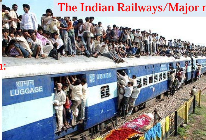
The Indian Railways/Major mode of transportation

Rural vs. Urban Conflicts;; Religion, caste & politics of violence; Gender violence, Caste System: Facts, myth & the contemporary society; Geopolitics (Kashmir: India & Pakistan & globalized terrorism)